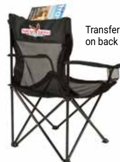
Transfer on back