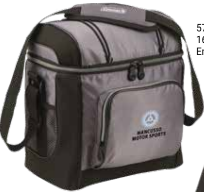
575.002.007.FG 16-Can Embroidery