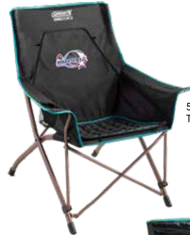
575.005.027.FG Transfer on front