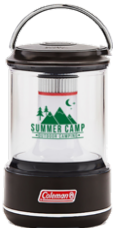
575.011.015.FG 1000L Black Screen