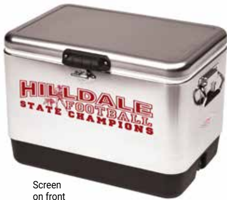
Screen on front