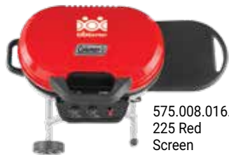
575.008.016.FG 225 Red Screen