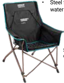
Screen on front