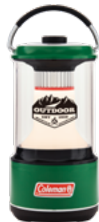
575.011.012.FG 600L Green Screen