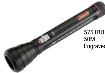
575.018.002.FG 50M Engraved