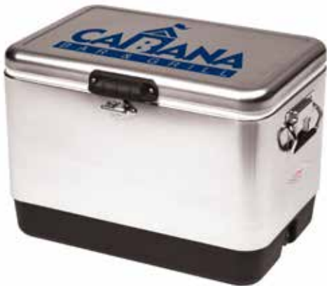
Screen on lid