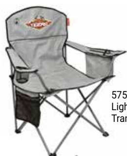
575.005.006.FG Light Gray Transfer on front