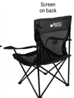
Screen on back