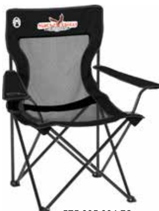
575.005.004.FG Transfer on front