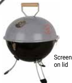
Screen on lid