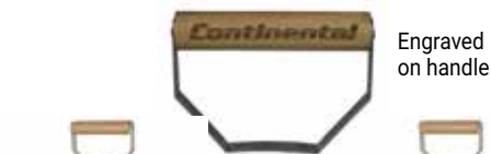
Engraved on handle