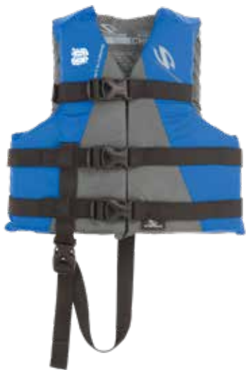
575.007.084.FG Child Transfer on front