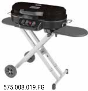
575.008.019.FG 285 Black