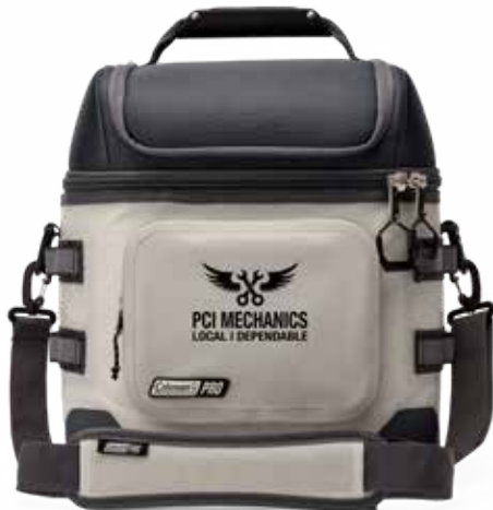
575.009.044.FG 24-Can Pro Screen on pocket