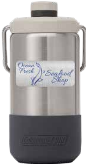
575.010.020.FG Metal Placard