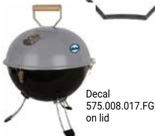
Decal 575.008.017.FG on lid