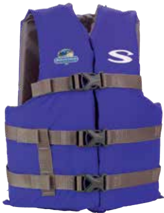
575.007.083.FG Youth Transfer on front