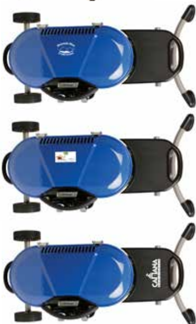
Screen on lid