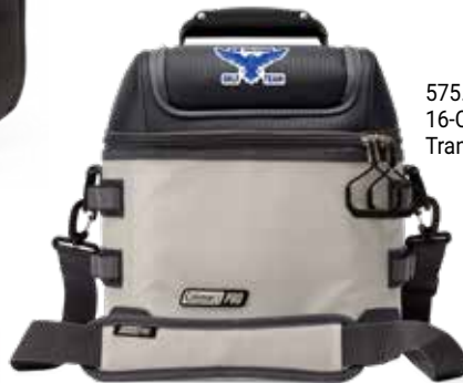
575.002.043.FG 16-Can Pro Transfer on flap