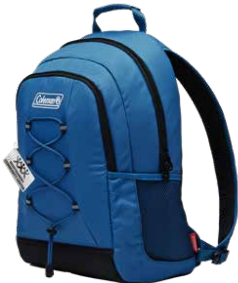
575.002.041.FG Ocean Blue Metal placard