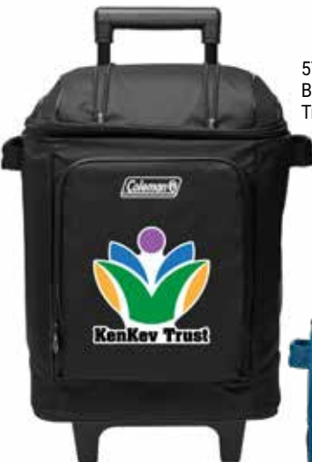
575.009.055.FG Black Transfer