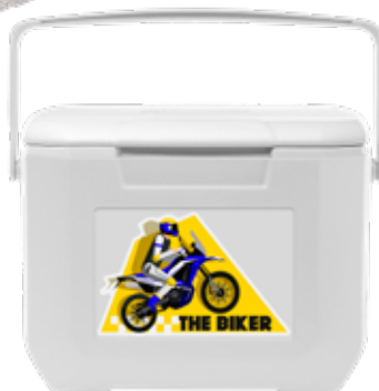
575.009.039.FG 16-Quart Decal