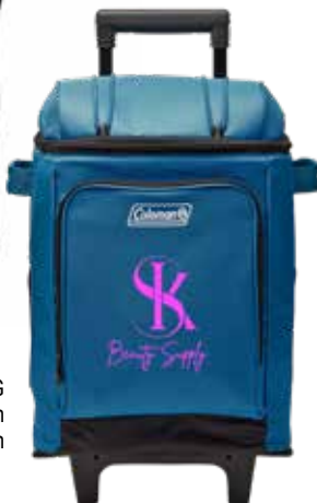
575.009.053.FG Ocean Screen