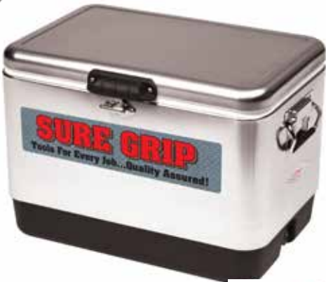
Decal on front