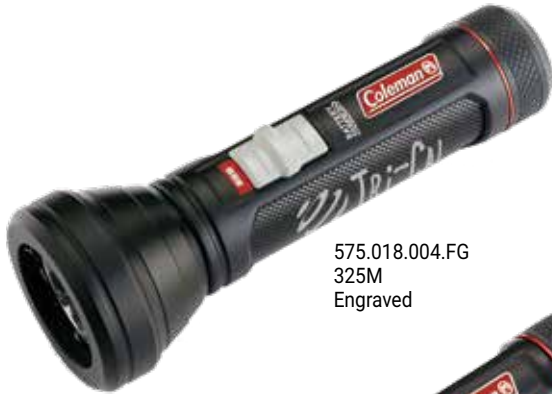
575.018.004.FG 325M Engraved