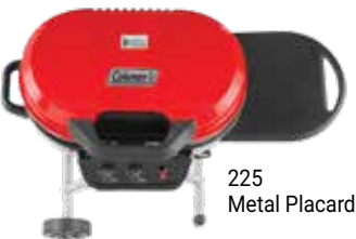
225 Metal Placard