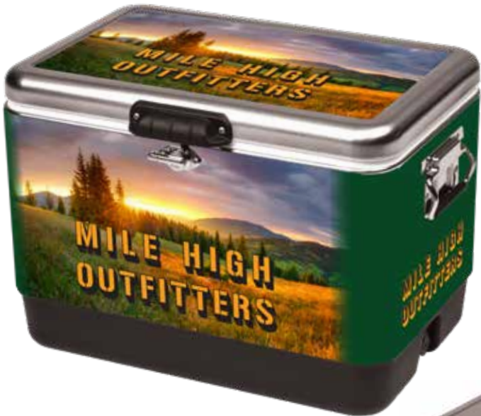
575.015.006.FG Stainless Steel Wrap