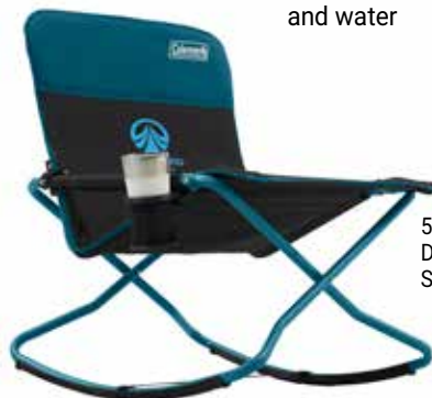
575.005.023.FG Deep Ocean Screen