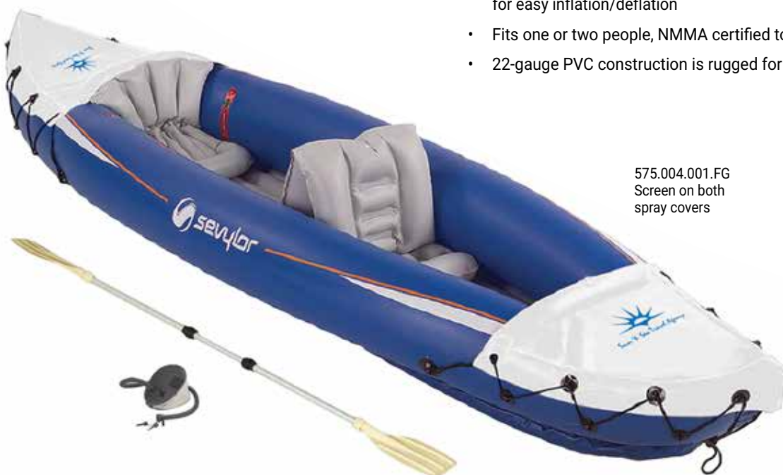
575.004.001.FG Screen on both spray covers