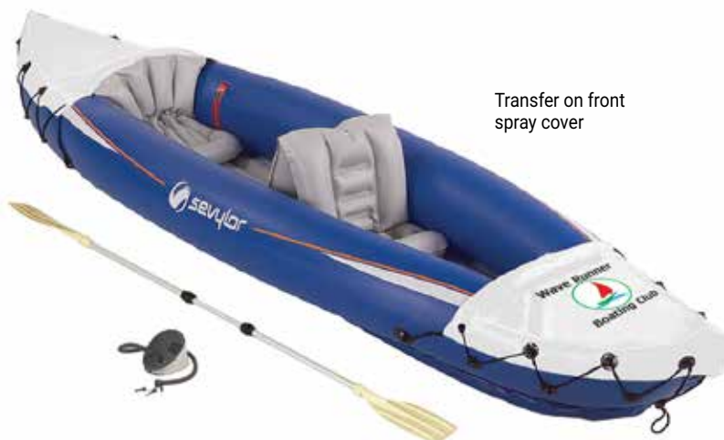
Transfer on front spray cover