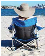
Back of Chair Back