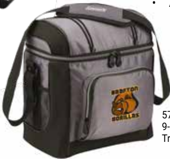
575.002.012.FG 9-Can Transfer