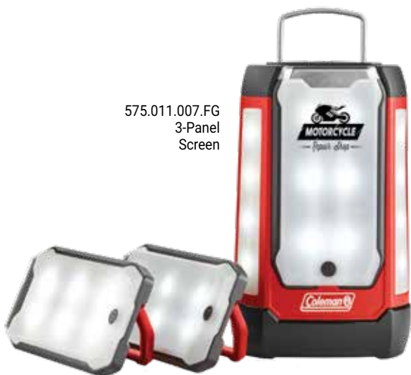
575.011.007.FG 3-Panel Screen