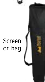
575.005.009.FG Red Screen on front