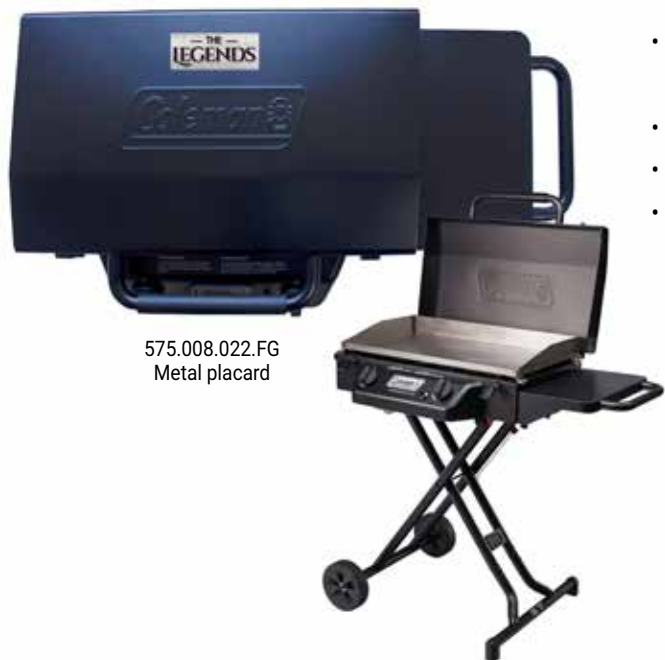
575.008.022.FG Metal placard