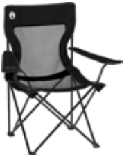
Front of Chair Back