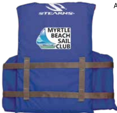
Adult Transfer on back