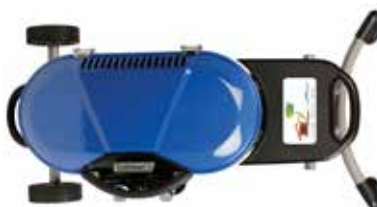
Decal on table