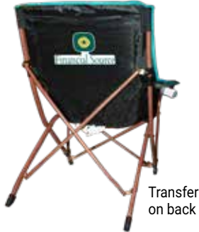
Transfer on back