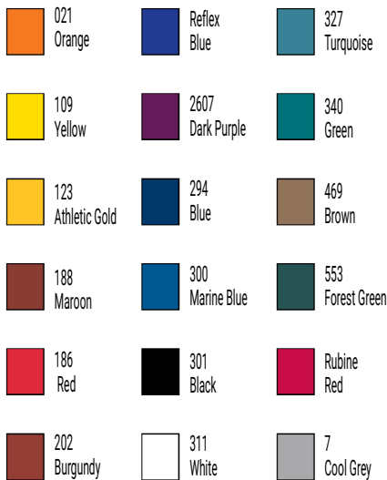
Chart shows standard colors available for imprint. When ordering, please indicate color choice by including number and name.

Printed colors on delivered products may be lighter or darker than shown here.