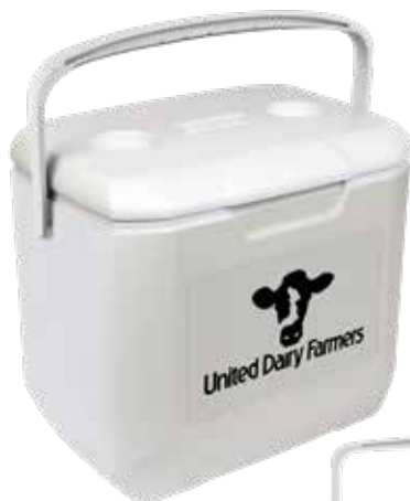
575.009.011.FG 30-Quart Screen