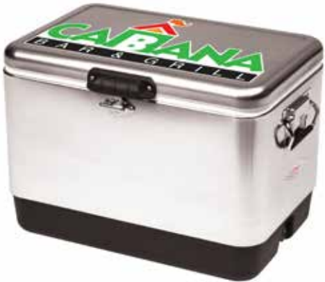
Decal on lid