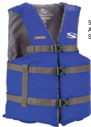
575.007.003.FG Adult Screen on front