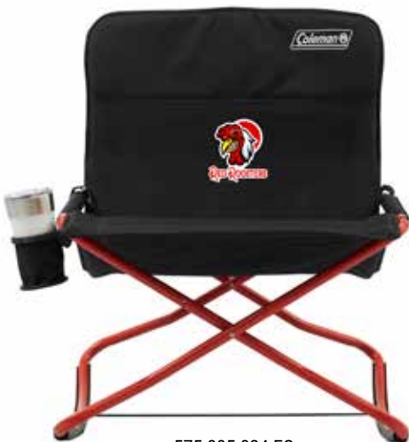
575.005.024.FG Black/Red Transfer