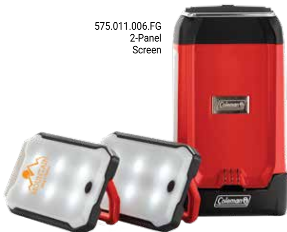
575.011.006.FG 2-Panel Screen