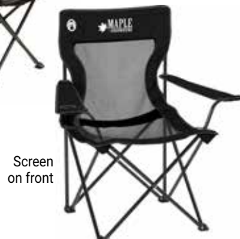
Screen on front