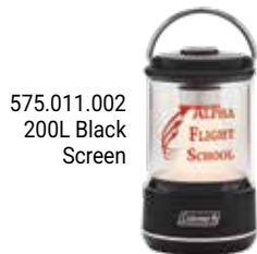
575.011.002 200L Black Screen