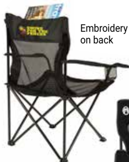
Embroidery on back