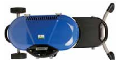
Metal Placard on lid