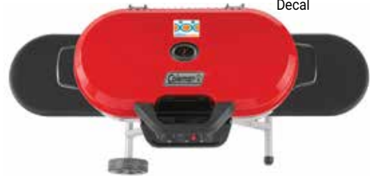
575.008.015.FG 285 Red Decal