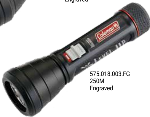
575.018.003.FG 250M Engraved